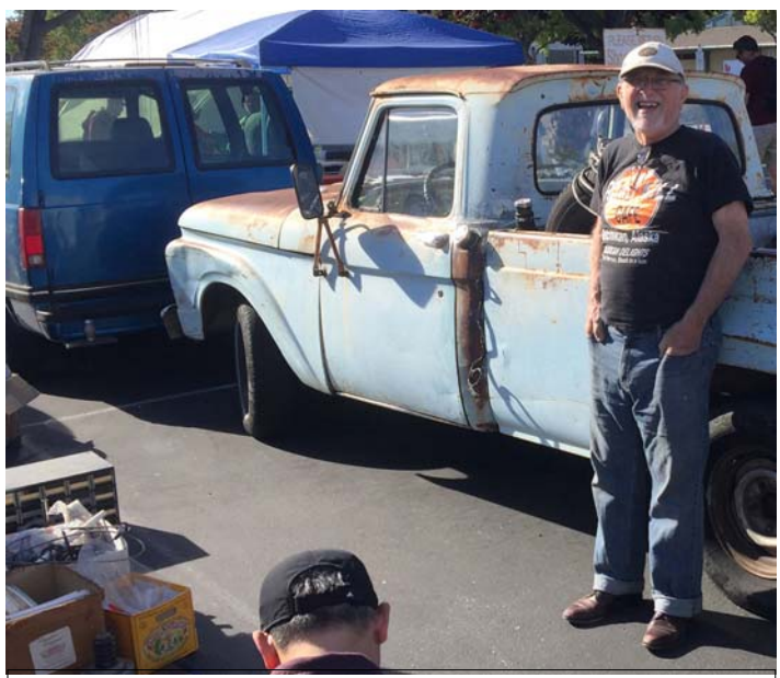
Selling At the Flea Market