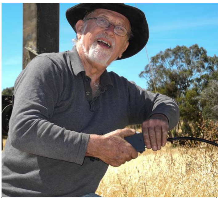
Analyzing the Antenna: The match is 1.5:1