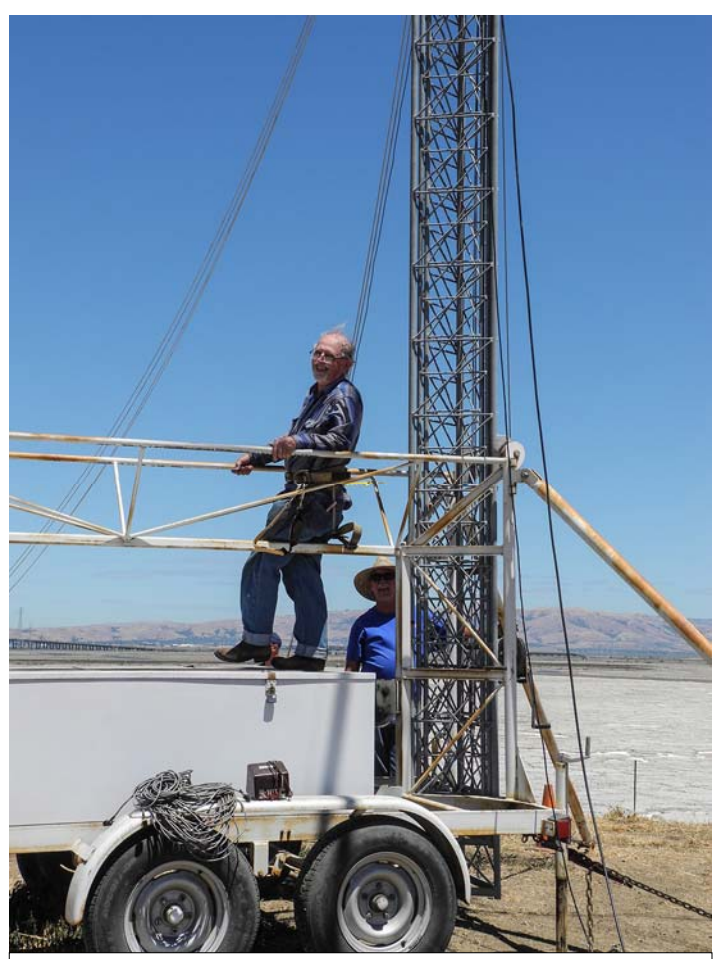
Helping at a Tower