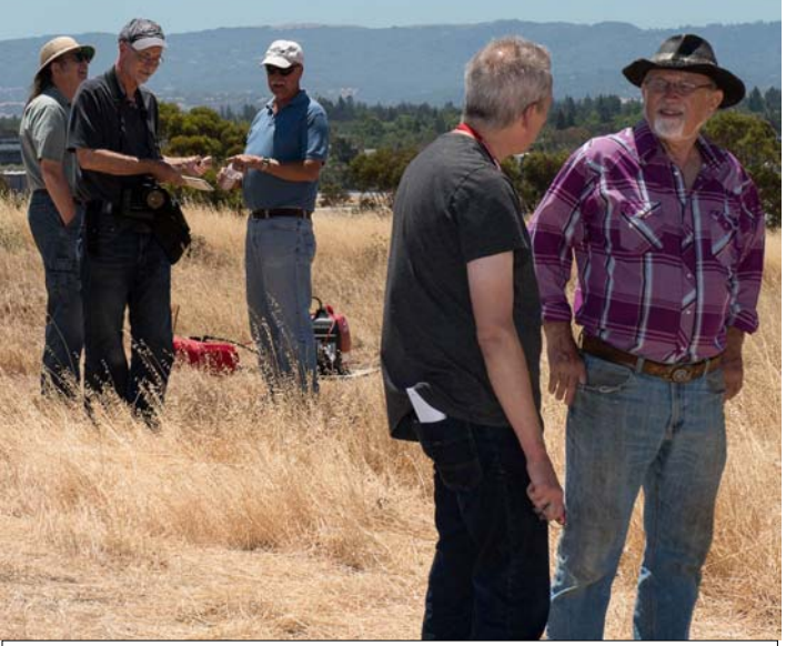
In the Field at Field Day