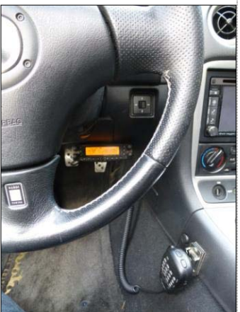
Fig 5: Head Unit mounted under dash

cover over the transmission tunnel and ran the data cable from the trunk up to the head. Rather than screw the mic holder into the tunnel, I chose to us heavy duty Velcro so I could remove it if I ever chose to sell the car. The setup isn't perfect, but it has served me well.