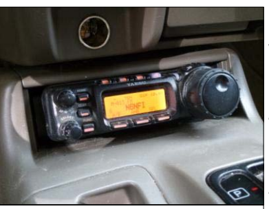
Fig 7: Yaesu FT-857D Head Unit

mounted with Velcro (Figure 6), so I can move it