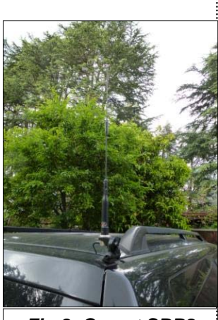
Fig 8: Comet SBB2

As to antennas, I chose a small hatch back mount for the VHF/UHF (Comet SBB2 18" 2M 2.15 dBi 1/4