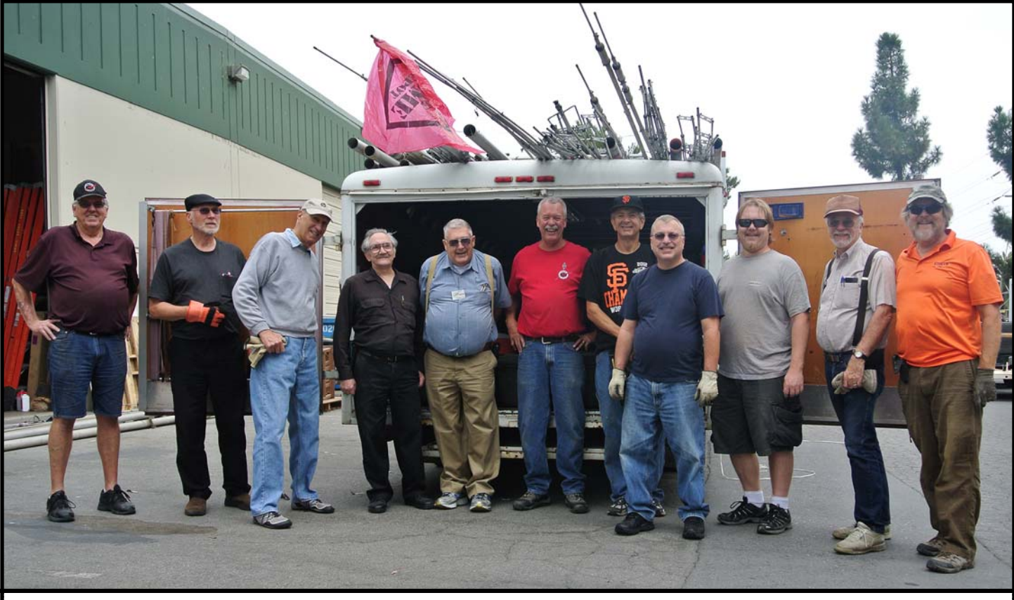
The Field Day Antennas & Equipment Moving Crew

As many of you know, the building where my shop and offices have been located for the last 21 years