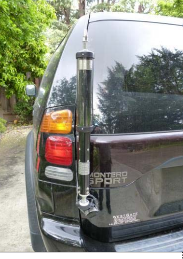
Fig 9: Little Tarheel II

screwdriver antenna. Although I put an antenna analyzer on the antenna and labeled the various bands on the barrel of the antenna, I have learned to tune the antenna by listening for the noise floor to increase on the band I am tuning. This actually works quite well. My furthest contacts include Tokyo, Japan and Argentina. It's been fun to have on long trips, as I had hoped.