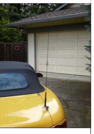
Fig 1: Miata & Comet

First off...it was lenges. critical for me to not detract from the lines of the car with the antenna. I decided on a small trunk lip mount and started with a short whip antenna (Comet SBB2 18" 2M 2.15 dBi 1/4 wave), which seemed to work well enough with the local repeaters. I would keep a longer antenna (Comet SBB5 38" 2M 3.0 dBi 1/2 wave), with more gain, in the trunk. But I fi-