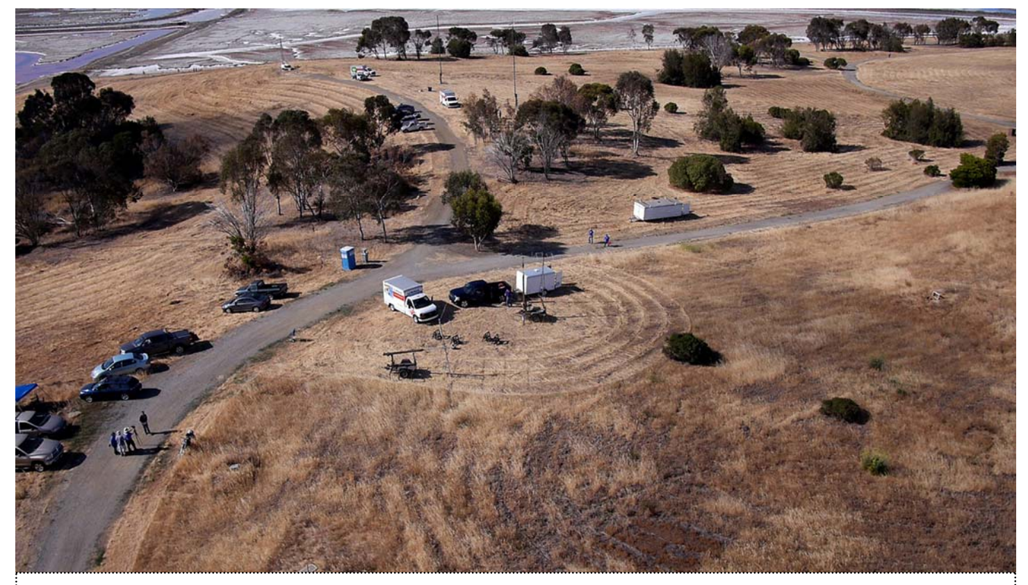
Aerial View of CW A, Phone A, Sat/VHF, GOTA taken Saturday Morning