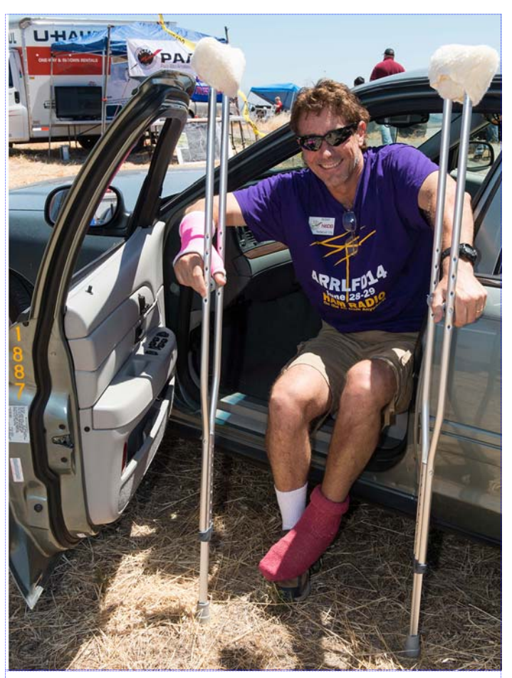
"Reporting for duty" You just can't keep a good man down!