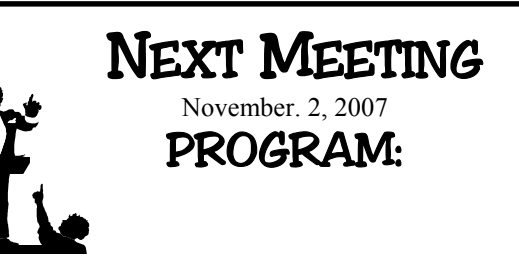
(Program not confirmed at press time.)